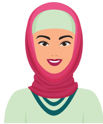
Afeefa Legal Department